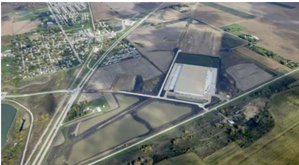
BISSELL - November 2008

Products is a multi-divisional manufacturing company supplying high quality products to various medical markets, as well as the food service, industrial, home health, government, and consumer markets.