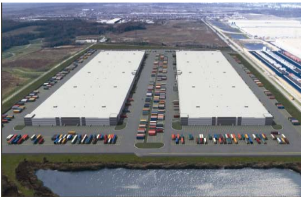
Import Distribution Centers - Rendering